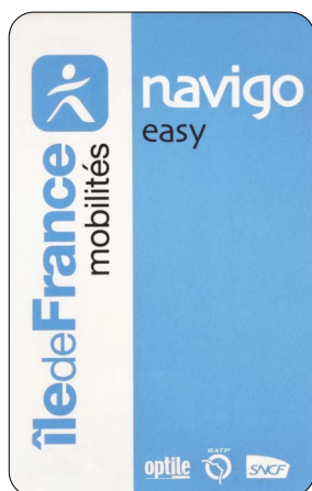
PASS NAVIGO EASY