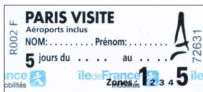
PARIS VISITE 5 DAYS, 5 ZONES

This ticket is personal and non-transferable.