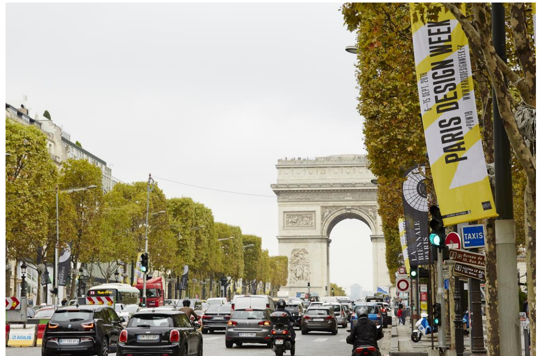
PDW 2018 Champs-Élysées