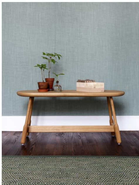
Institut suédois