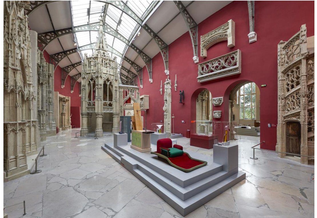
Cité de l'architecture et du patrimoine© DR

Tai Ping, the design house and manufacturer of bespoke carpets, is set to open its showroom to present Raw by Noé Duchaufour-Lawrance. This collection, which features 5 core designs (from a total of 11), explores the origins of our planet, the formation of the earth, the foundation of civilisation and the tension between tectonic plates. Through the pieces on show, the designer demonstrates how Raw gleans its inspiration from the hardness of rock, then transposing it into something soft.