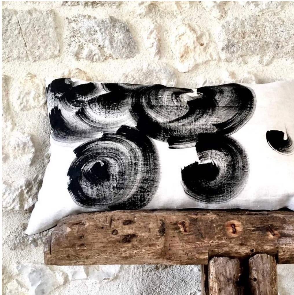
Nûr Gallery