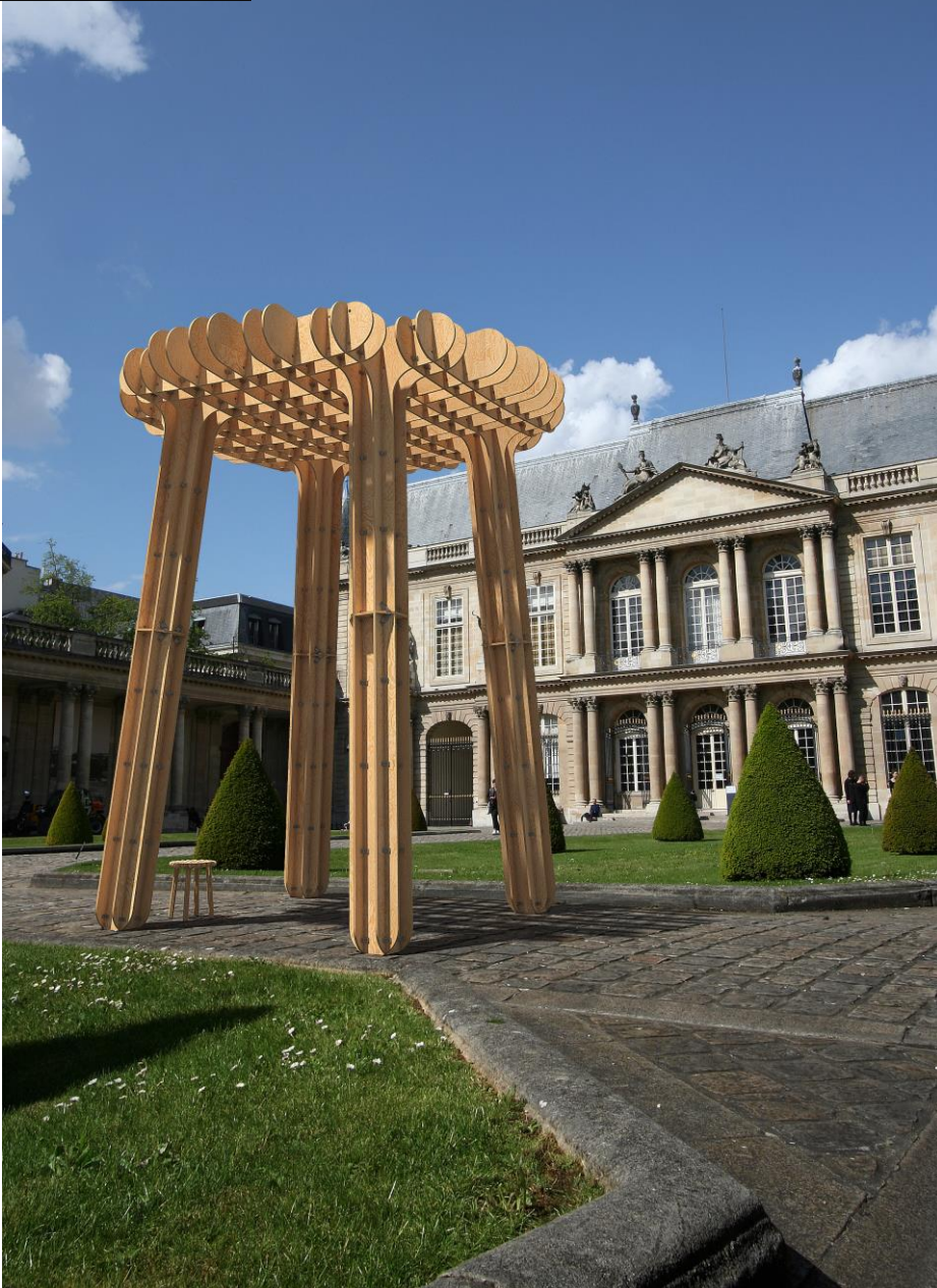
Ubik aux Archives Nationales

Above and beyond purely linking up a designer or brand with a cultural or historic venue, what PARIS DESIGN WEEK hopes to achieve is a real encounter, one that will stimulate cultural communication and encourage opinions and approaches to be shared, even if they differ wildly. It is also a way of allowing the audience to discover not just a work or event, but also the host venue.