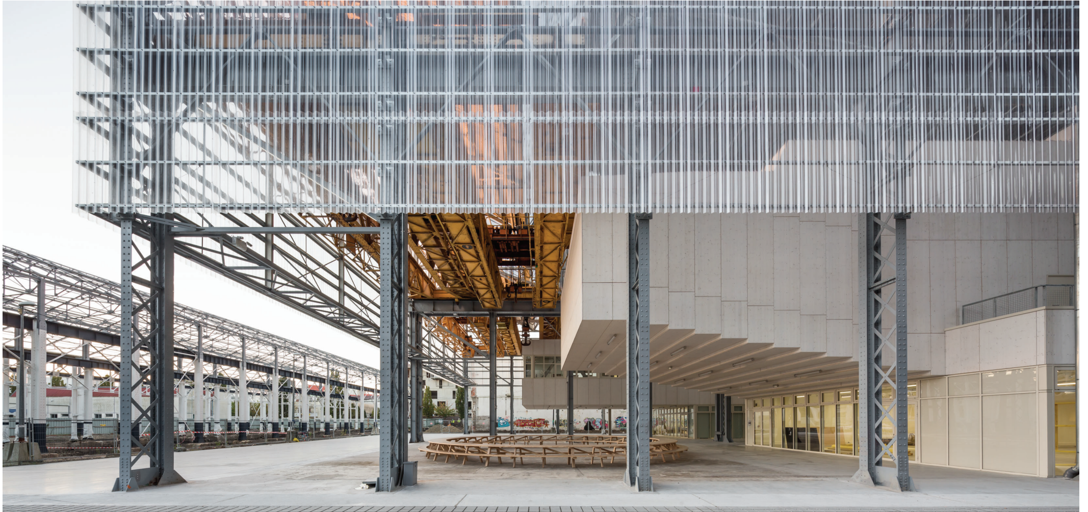
Fine Arts School Nantes (France)

« I don't see how we can imagine the future without analyzing the past »