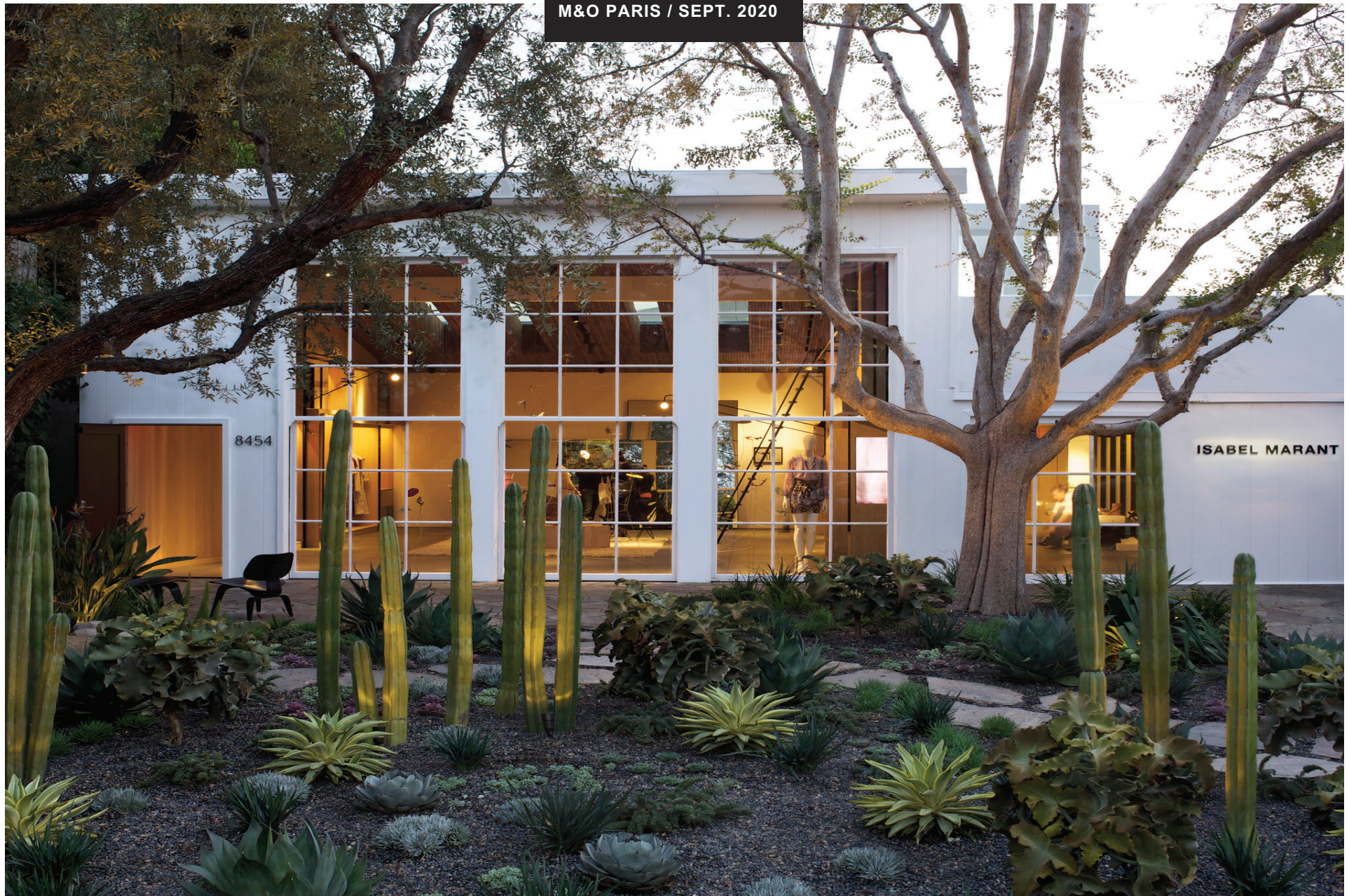
Isabel Marant Store Los Angeles, CA (US)