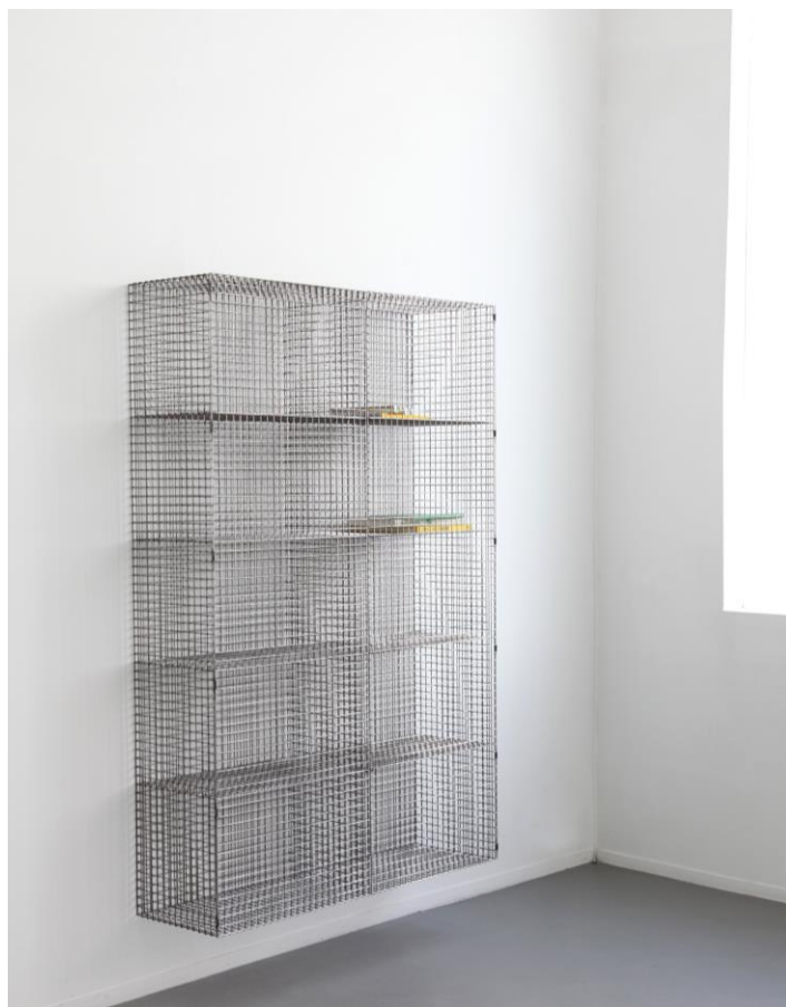
Cabinet, collection WIRE C #1 Muller Van Severen