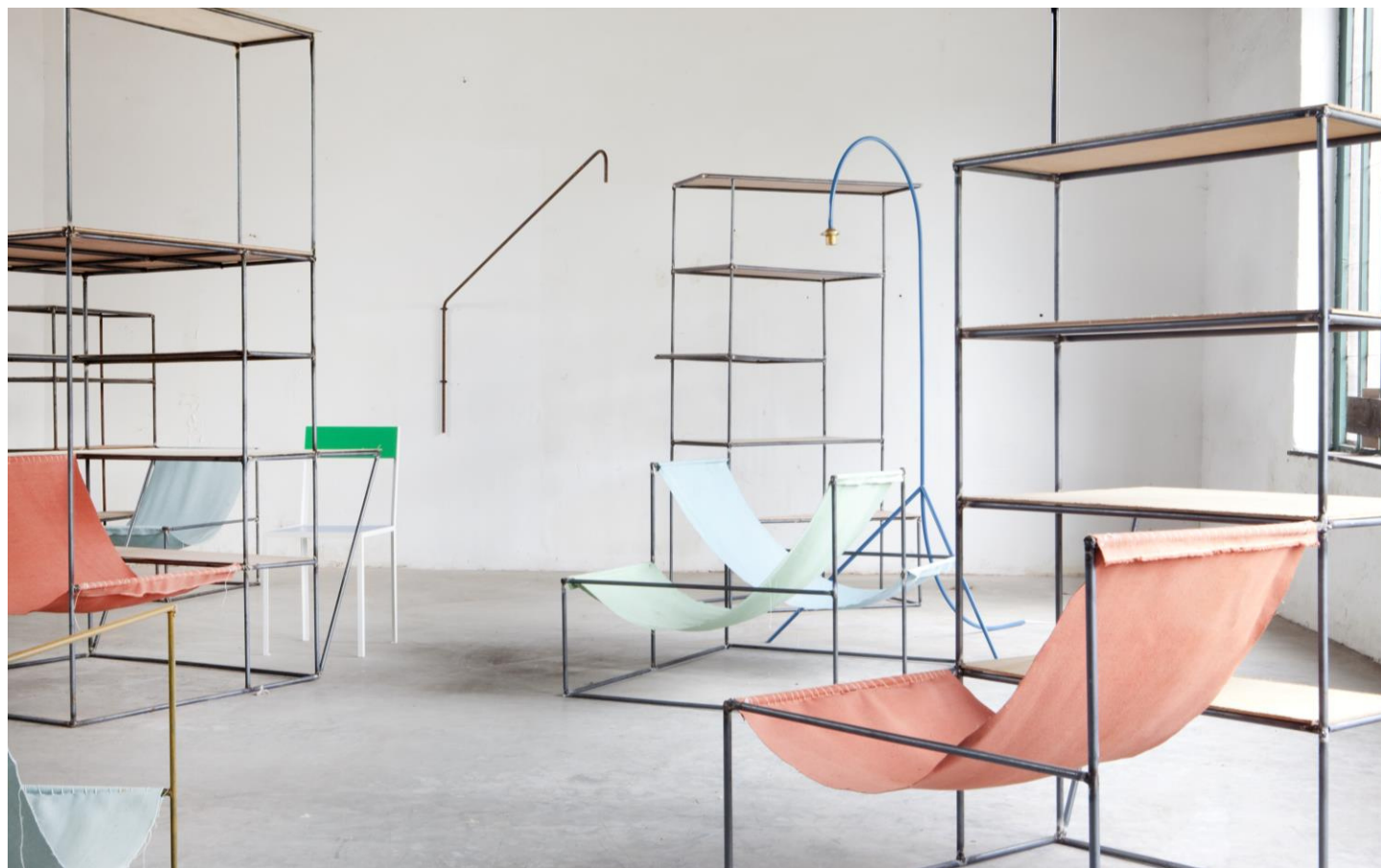
The Muller Van Severen studio

This palette dresses the picture rails and the podiums presenting creations. A festive chromatic explosion and an invitation to "Enjoy!", echoing the theme of this edition of Maison&Objet.