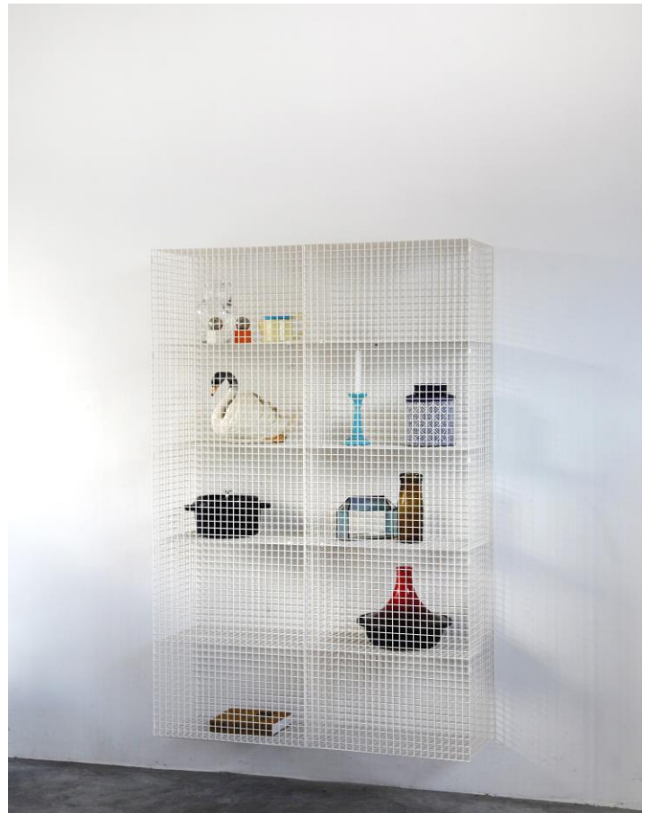
Cabinet, collection WIRE C #1 Muller Van Severen