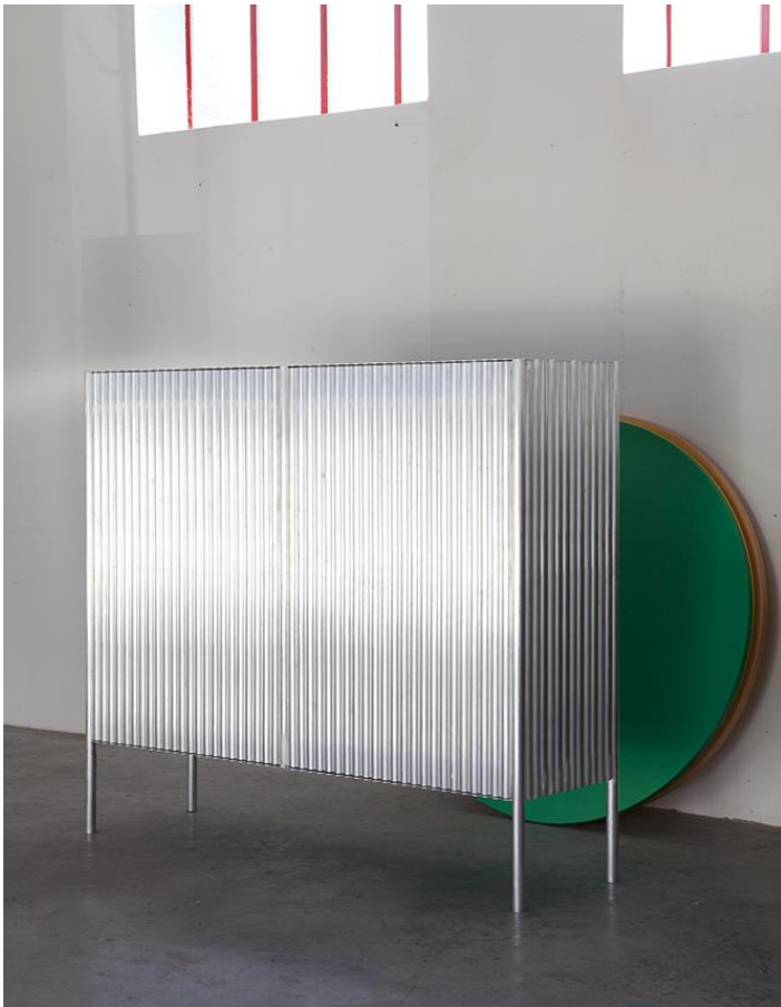
Cabinet, collection ALLTUBES Muller Van Severen