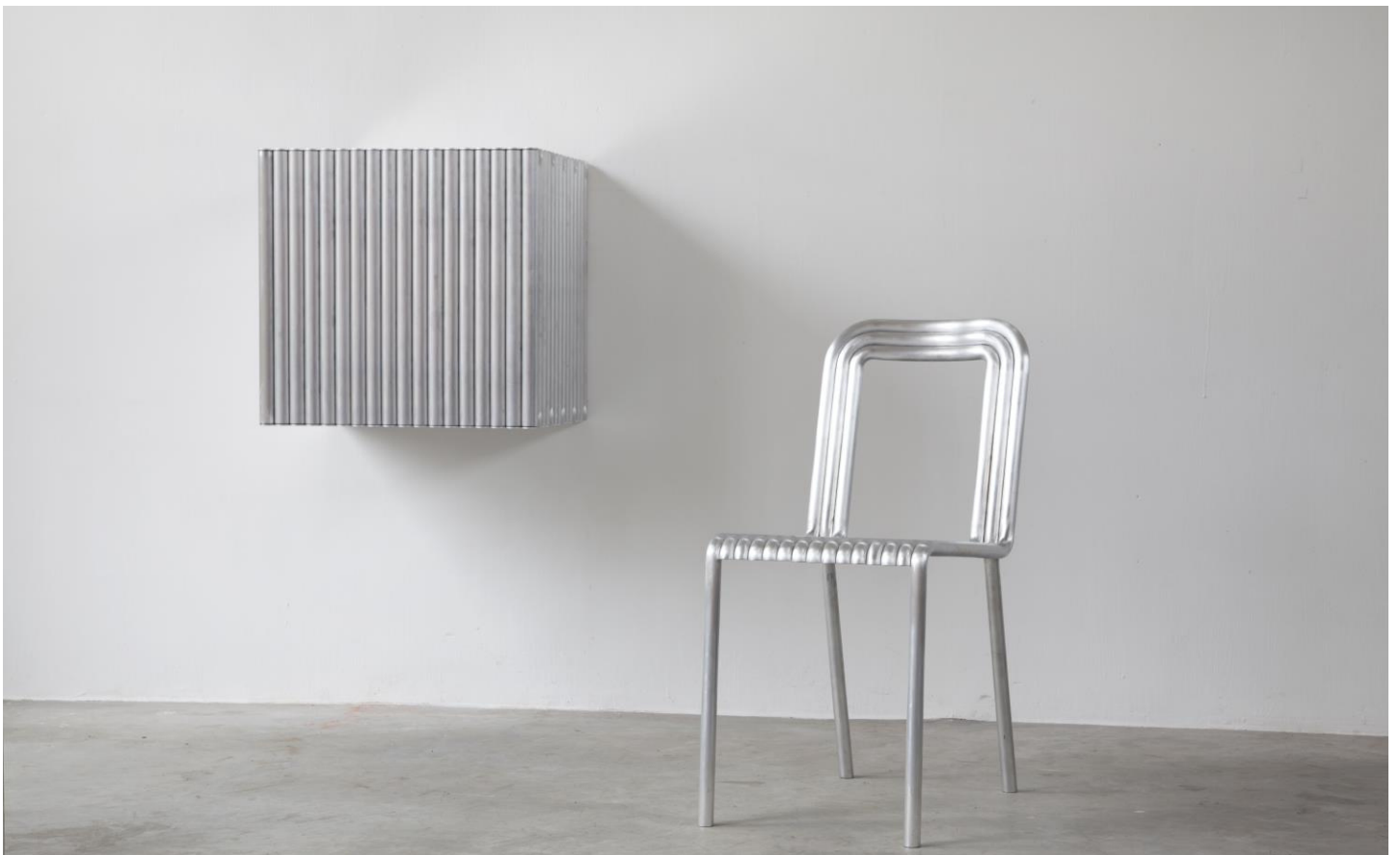
Chair and cabinet, collection ALLTUBES Muller Van Severen