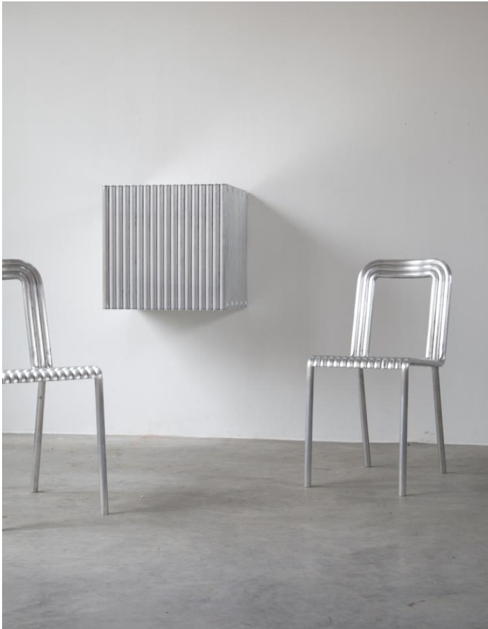
Seats and cabinet, collection ALLTUBES Muller Van Severen