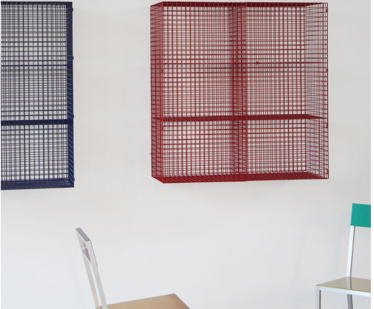
Cabinets, collection WIRE C #2 Muller Van Severen