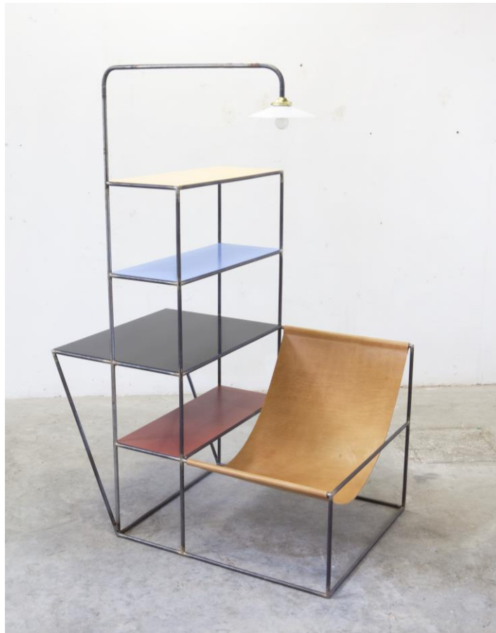
“Installation S”, FUTURE PRIMITIVE series Muller Van Severen

The exhibition will reflect their creative territory, combining pieces from their iconic “Future Primitive”, “Wire”, or “ALLTUBES” series. It will also be an opportunity to present new productions and commissions, including a series of vases for Bitossi, a luxurious rug imagined for the furnishing textile leader Kvadrat, or a floor lamp developed for Valerie Objects.