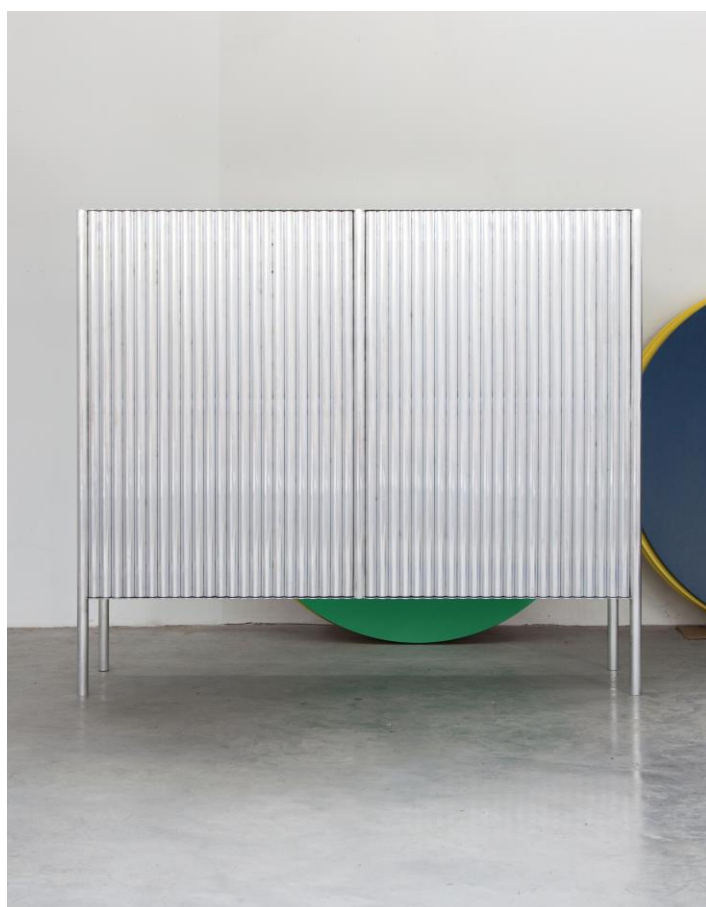
Cabinet, collection ALLTUBES Muller Van Severen