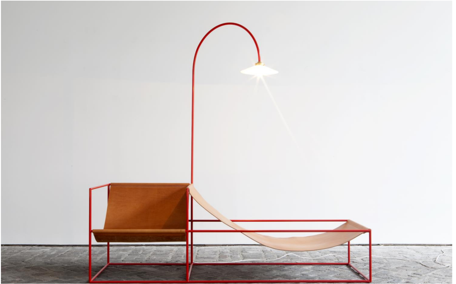
The "Duo seat+ lamp" encourages people to sit very close to each other without seeing each other. Muller Van Severen