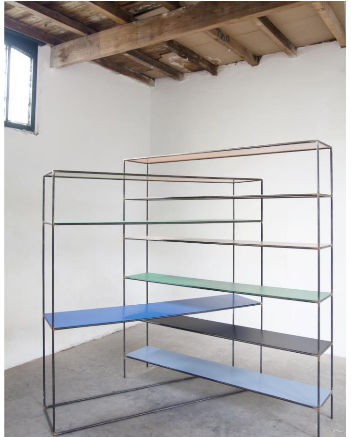
"Strangled rack", FUTURE PRIMITIVE series Muller Van Severen