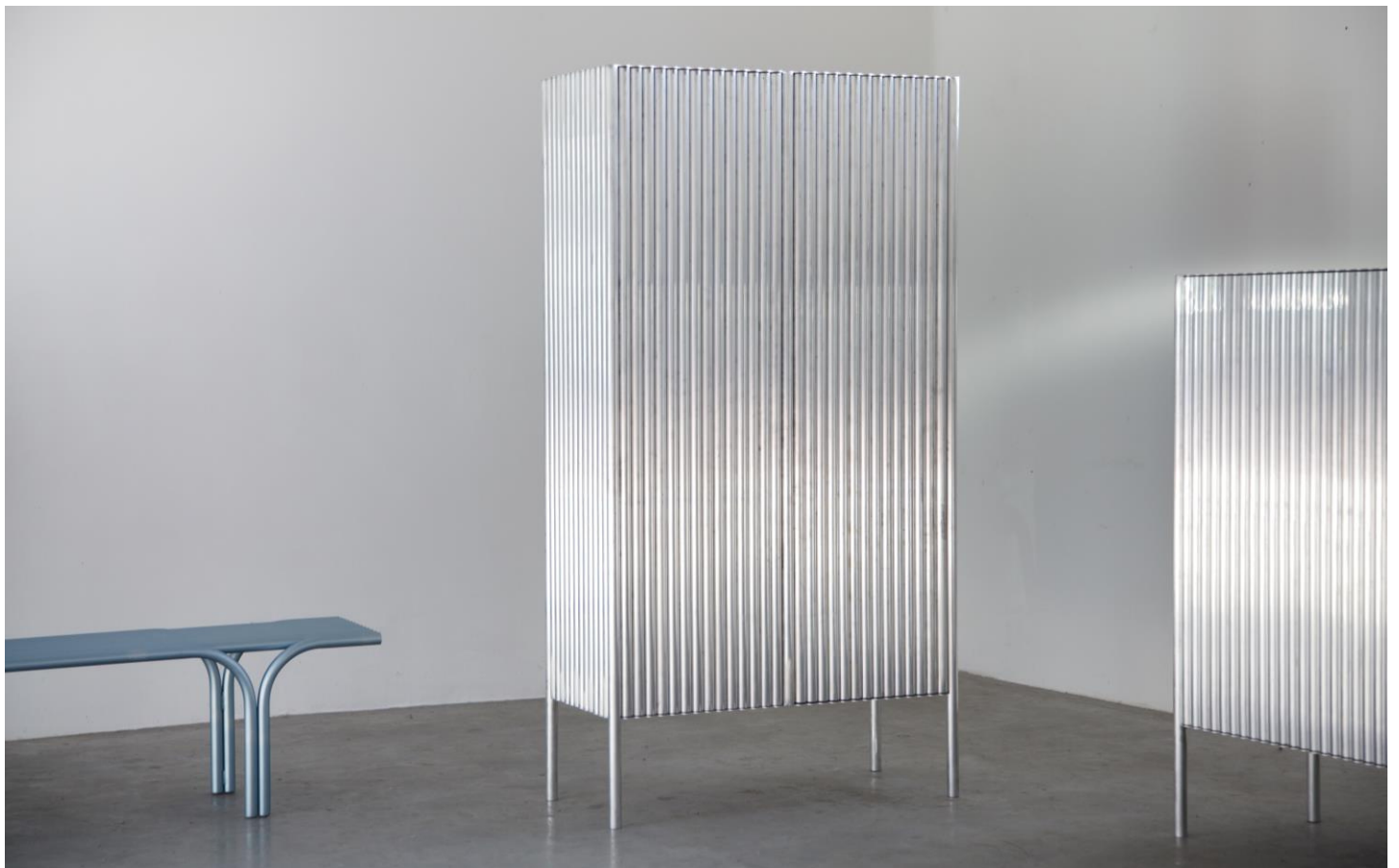
Cabinets and bench, collection ALLTUBES Muller Van Severen