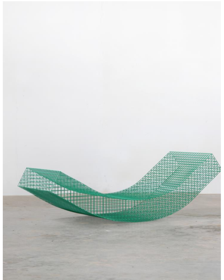
Green seat, collection WIRE S #1 Muller Van Severen

The designer duo extended this quest for minimalistic transparency with curved metal mesh lounge chairs. The result of a furniture commission for one of the "Solo Houses" located in Spain conceived by the Belgian architect's office, OFFICE KGDVS, these seats in stainless steel net presented on the booth will act as an invitation to rest, seemingly floating in the air.