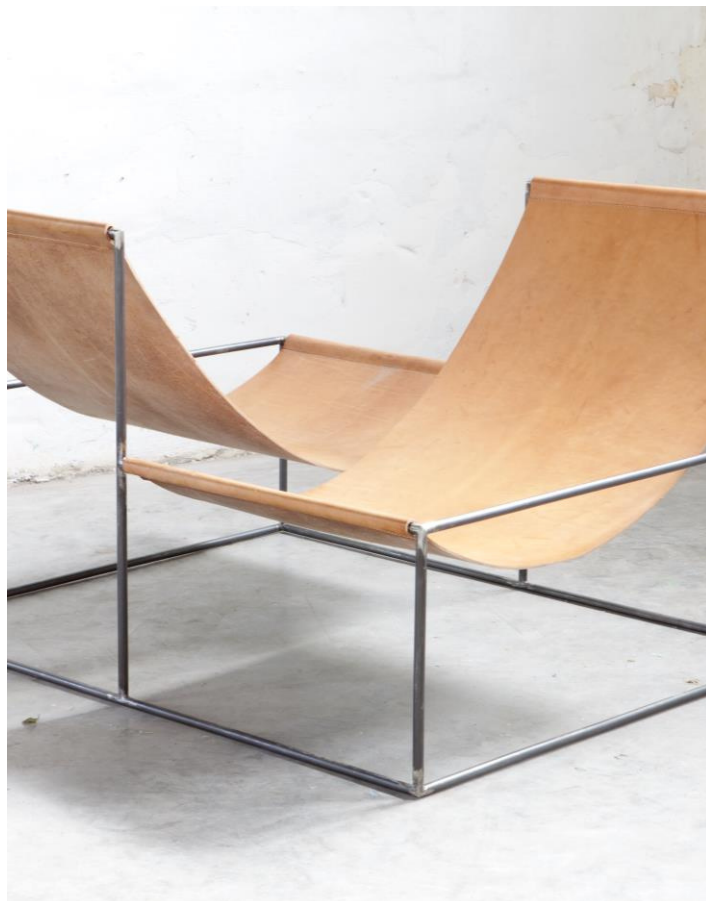
"Crossed double seat", FUTURE PRIMITIVE series Muller Van Severen

"We are creators but above all 'manufacturers'. Our need to make, grasp, act and transform materials gives us the most pleasure. It's a matter of sensation: interacting with matter awakens our senses and gives us ultimate joy. It is this pleasure of making that we wish to convey to the visitors," they conclude together.