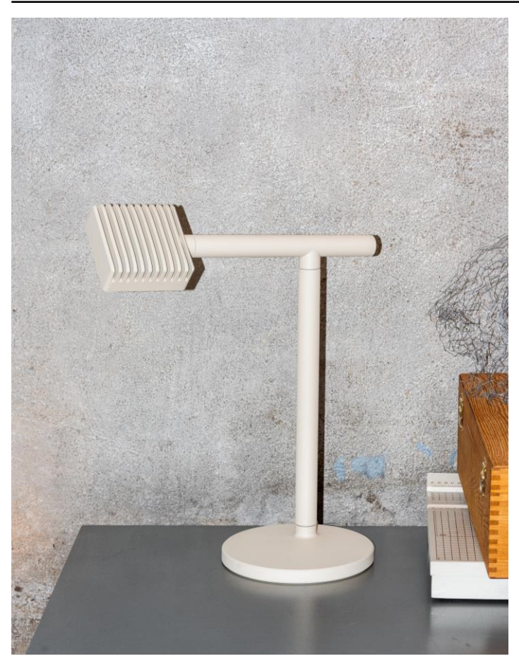
Desk lamp "Dorval" collection - SCMP Design Office