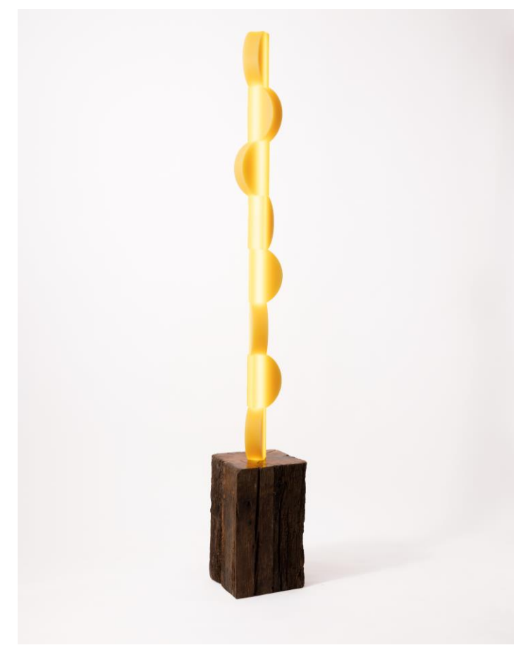
"Totem Axis 2.0" light sculpture, Mellow Yellow - Tim Leclabart