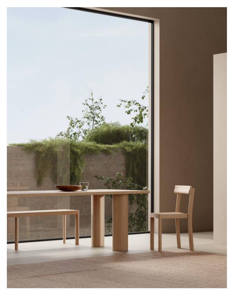
"Galta" Collection for Kann Design - SCMP Design Office