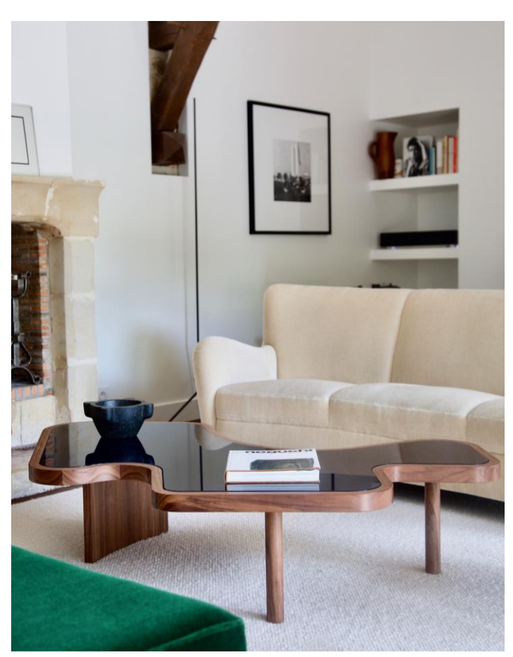
"Curved" coffee table - Tim Leclabart