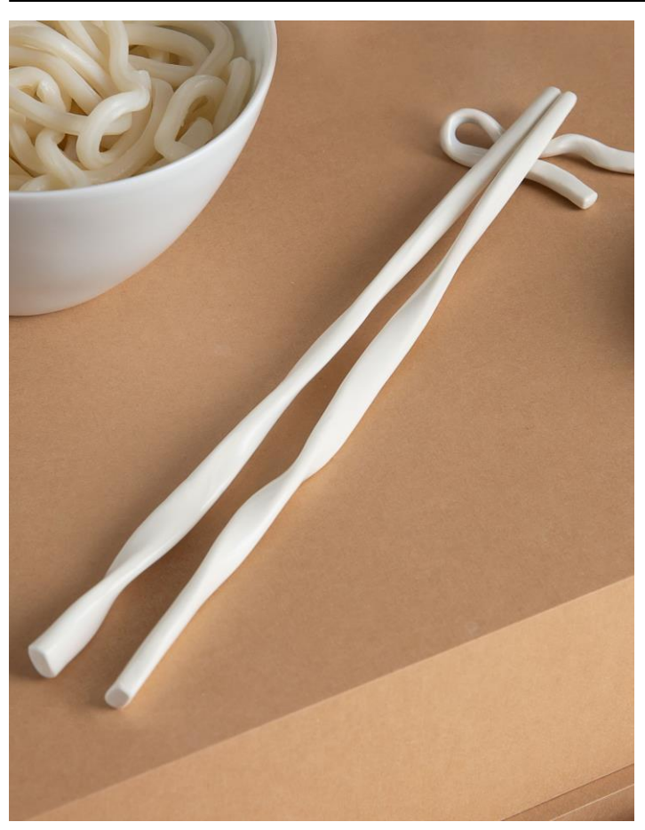
"Copy Pasta" chopsticks - Athime de Crécy