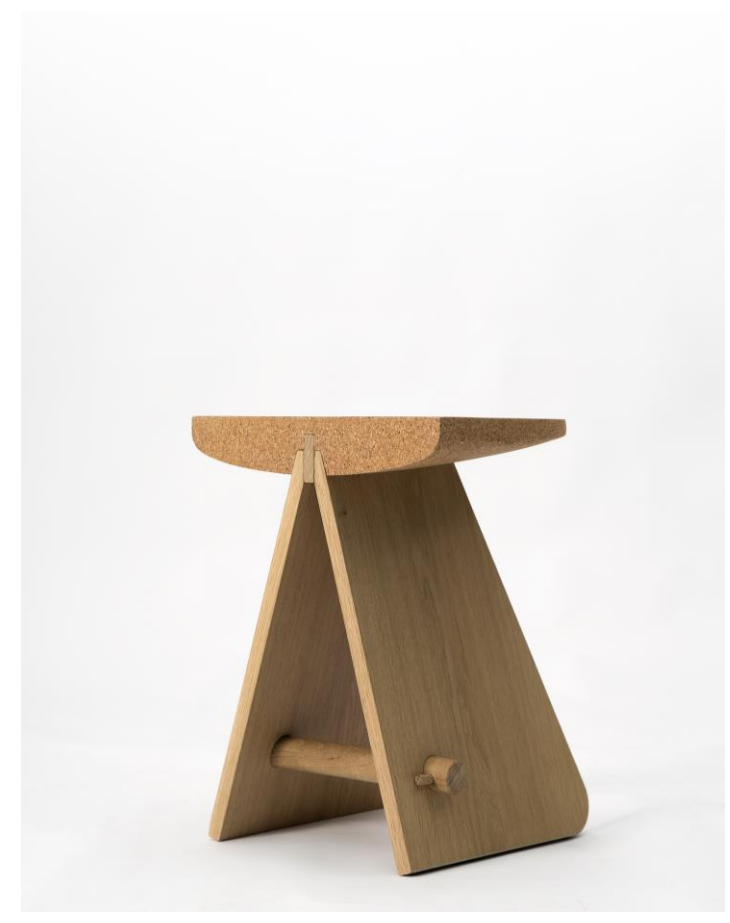
"Escale" stool - Nicolas Verschaeve