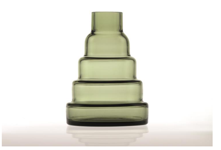
Vase collection "Sillages" - Nicolas Verschaeve