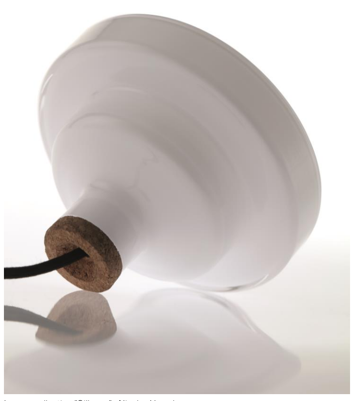
Lampe collection "Sillages" - Nicolas Verschaeve