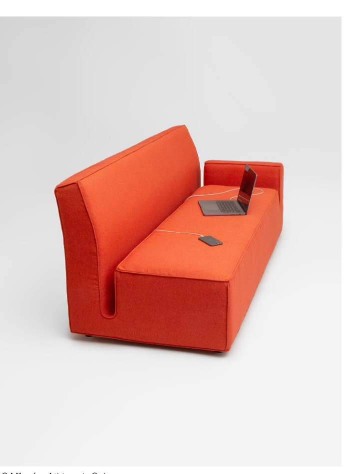
"S.C.M" sofa - Athime de Crécy