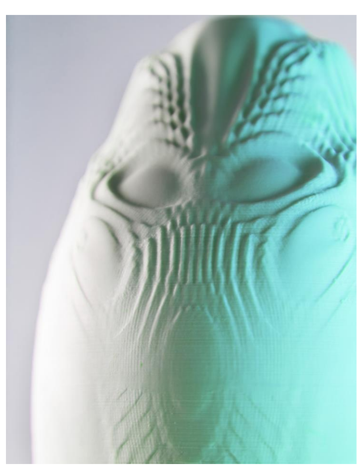
Porcelain vase - Hugo Drubay