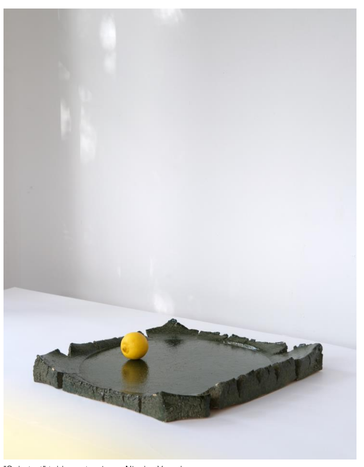
"Substrat" table centerpiece - Nicolas Verschaeve