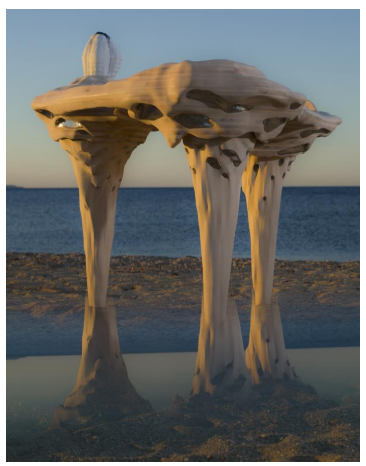
"Spire" desk from the Mobilier national - Hugo Drubay ©Paul Rousteau