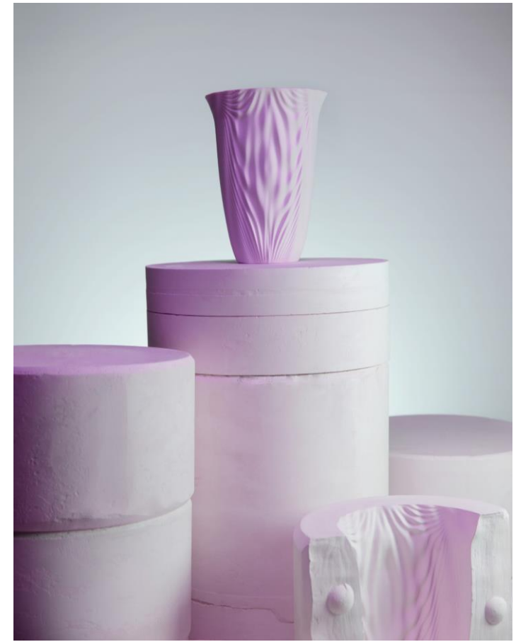
Porcelain vase - Hugo Drubay