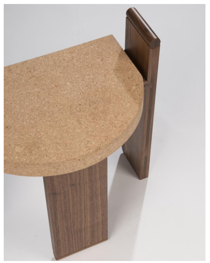
"Cork" stool - Tim Leclabart