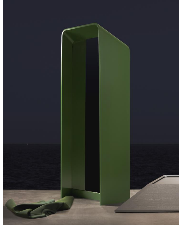
Advertising campaign for the first Passage collection. Photographed by Igor Pjörrt in 2022.