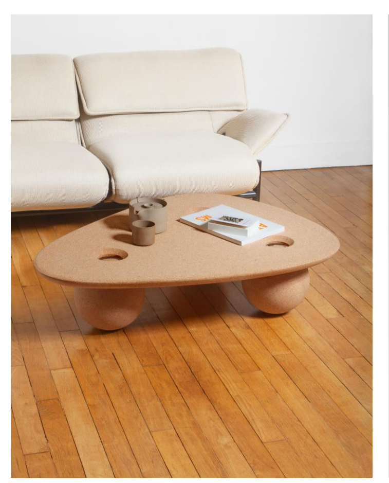
"Galileo" coffee table - Athime de Crécy