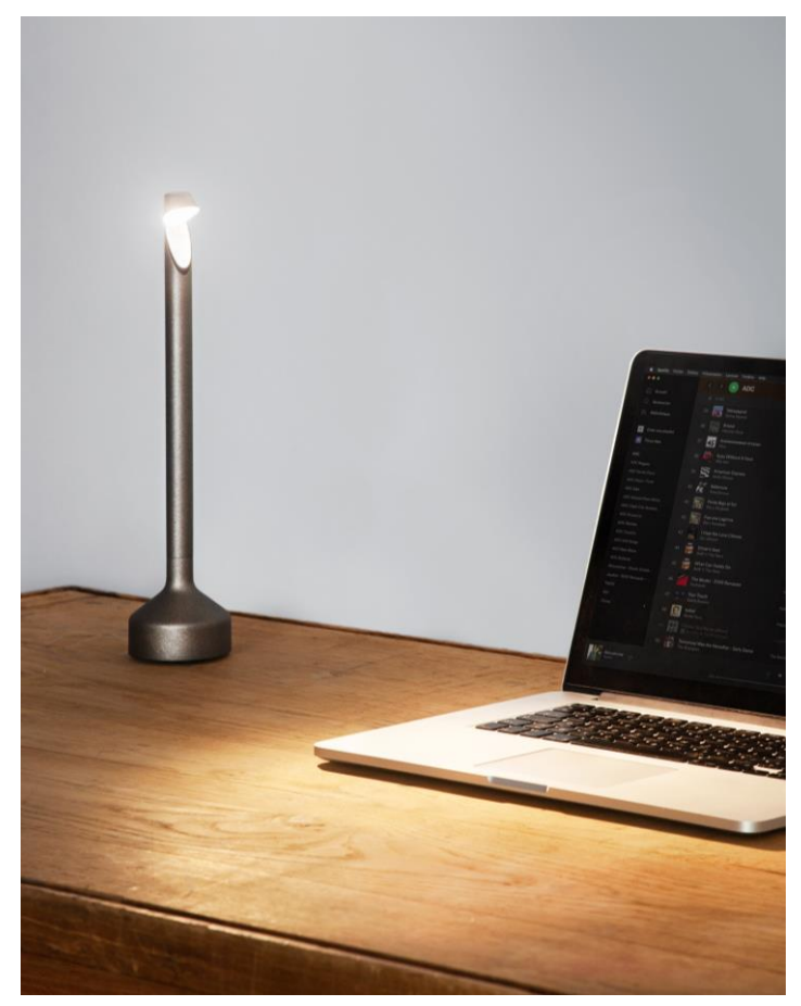
"Fresnel Family" desk lamp - Athime de Crécy