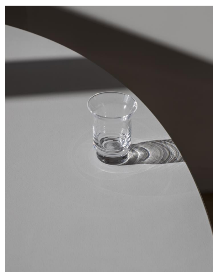
"Optica" glass for Kimoto - SCMP Design Office ©SCMP Design Office