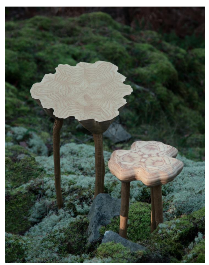
Wooden furniture for Design Parade - Hugo Drubay