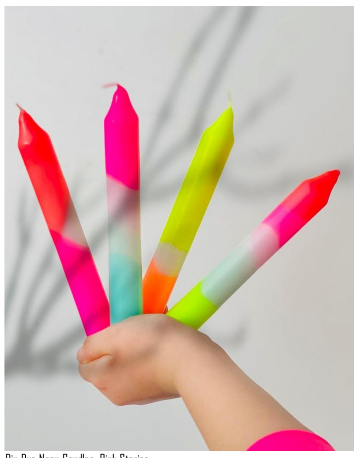
Dip Dye Neon Candles, Pink Stories