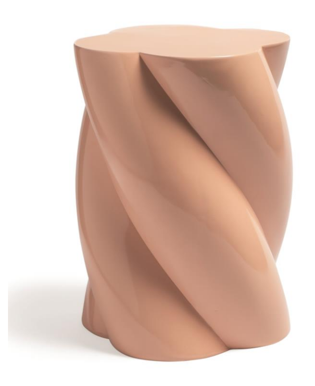
Marshmallow Pillar, &klevering @&k Amsterdam