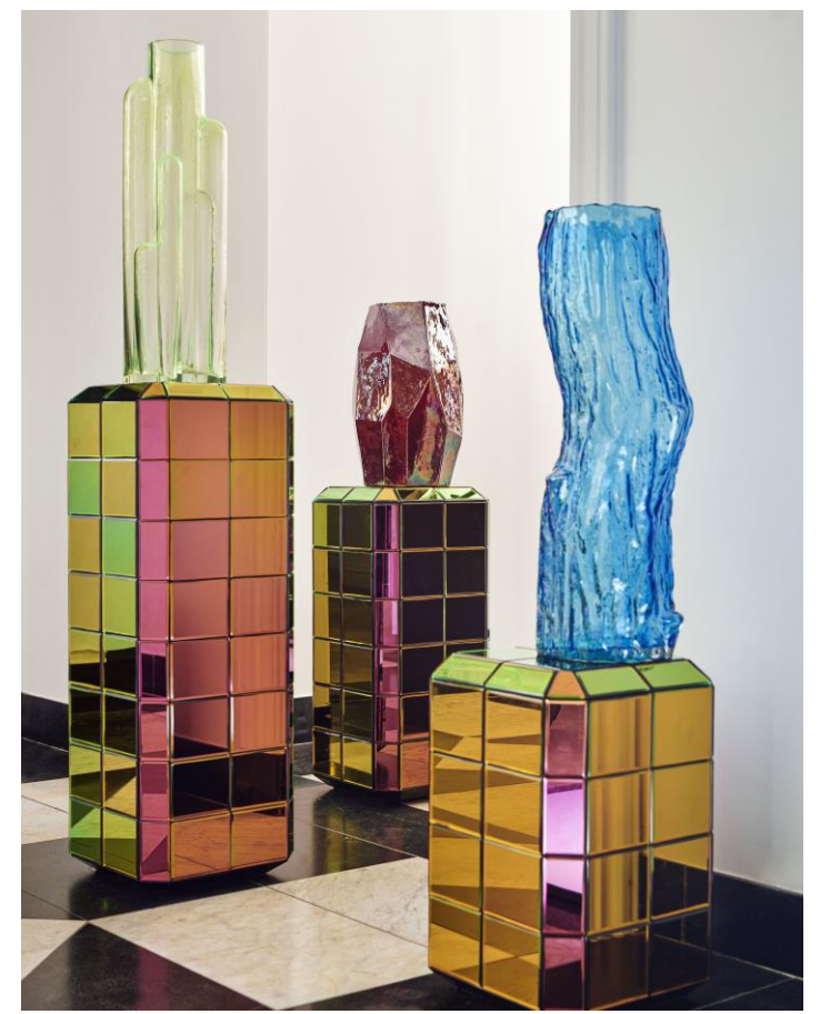
Pixel Pillar, PolsPotten

Once again this year, Maison&Objet Paris will clearly be so much more than simply a trade fair: it will be a place that invites visitors to explore unique sensory experiences and tap into tomorrow's trends. As well as the "in" event (at the Exhibition Centre), Maison&Objet Paris will also host "off" events (Paris Design Week) as well as "on" events (online via the MOM digital platform and the Maison&Objet Academy). Proof itself that hybridisation is now a firm fixture within decoration, design and lifestyle community, too!