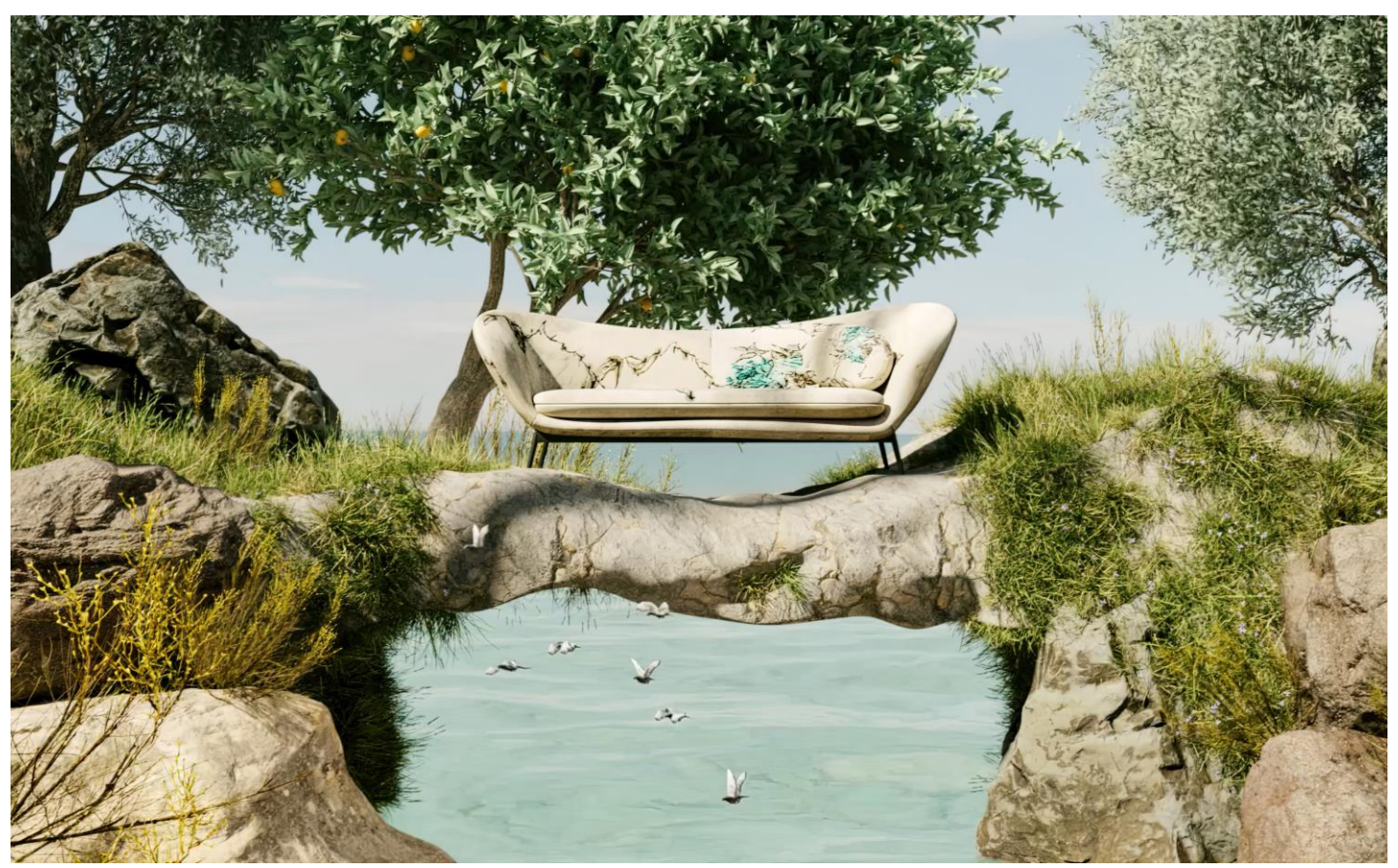
Oltre NFT, Saba